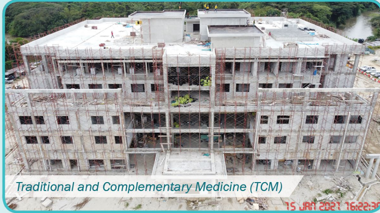
Traditional and Complementary Medicine (TCM)