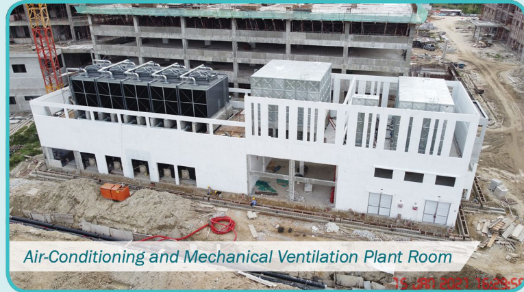
Air-Conditioning and Mechanical Ventilation Plant Room